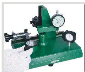
check force of dial indicators