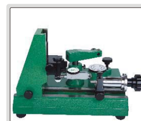
inspect accuracy of test indicators