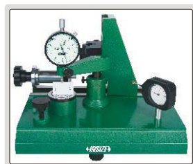
check repeatability of dial indicators