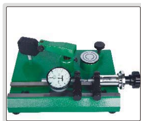
inspect accuracy of dial indicators (range 0-25mm)