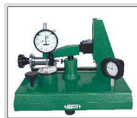
check the effect of lateral force on accuracy of dial indicators (half round gage block is required)