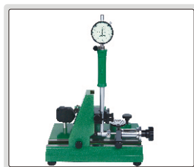
inspect accuracy of dial bore gages (range 6-450mm)